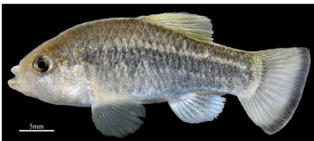
Fig. 1 Cyprinodon bovinus , male, collected from Diamond Y pool within the Diamond Y Spring Preserve, Pecos Co., TX

One group of freshwater fishes of particular conservation concern are pupfishes in the genus Cyprinodon (Family Cyprinodontidae) in southwestern North America (swNA). The genus contains 31 currently recognized species in swNA (southwestern United States and northern Mexico; Echelle and Echelle 2020). Phylogenetic analyses suggest that a common ancestor to the group was widespread across a wetter swNA during the Pliocene (~3 MYA), but as the region became arid, populations became isolated in pockets of habitat that remained, driving speciation in the group (Echelle et al. 2005; Hoagstrom and Osborne 2021). Currently, many pupfish species in swNA have extremely limited ranges, with fragmented distributions and small population sizes (Echelle 2008). Because swNA is an arid region, human water usage has become a major threat to naturally limited pupfish habitat (Baugh and Deacon 1988; Lewis et al. 2013; Black et al. 2017). To address these issues, many of these habitats have been the focus of protection by state or federal agencies or non-government organizations and other conservation practices (Minckley and Deacon 1991). Furthermore, some species are now maintained in ex-situ refuge populations as a buffer against continued decline in the wild, including C. diabolis (Devils Hole pupfish), C. elegans (Comanche Springs pupfish) and the focal species of this study, C. bovinus (Leon Springs pupfish, Fig. 1; Baugh and Deacon 1988; Black et al. 2017).